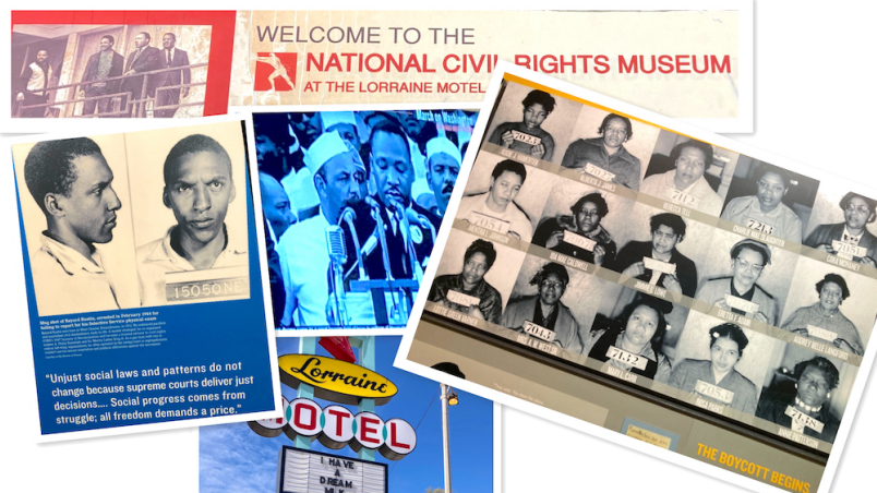
Left: Bayard Rustin at his 1944 arraignment for Draft Refusal. Right: The women workers arraigned for supporting the Montgomery Bus Boycott in 1956.